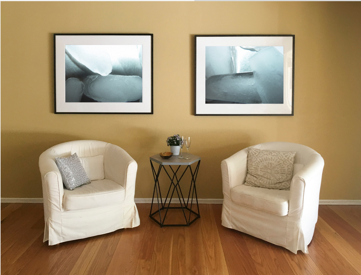
"Ice Transitions" in private residence

Limited Editions and original art to hang. All lens-based work with final digital production.