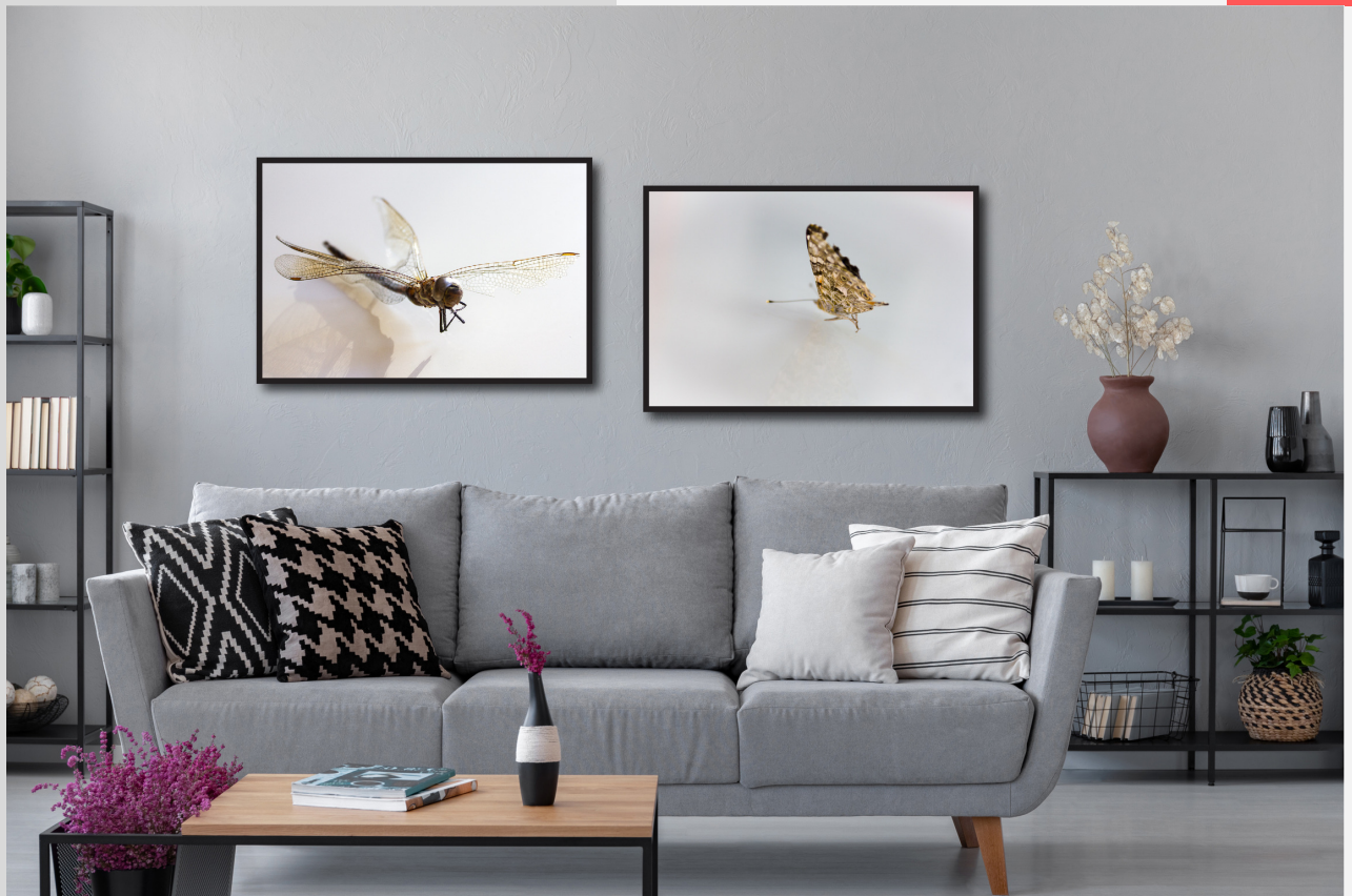
"Dragonfly" and "Butterfly" in private residence