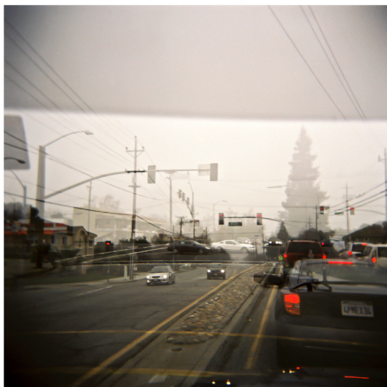
Photograph: "9:16am (San Jose)"

In 2017, I launched studiosiegXclusive , an art-to-wear clothing and accessories line featuring my photographs on skirts, dresses, scarves, a few shirts, bags and more to come (well, as long as you can wear it).