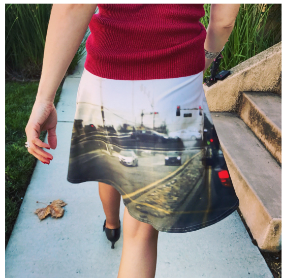
Art-to-wear: the "Traffic Skirt"