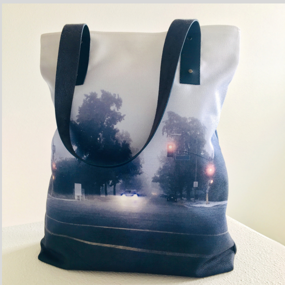
Morning Musing Urban Bag