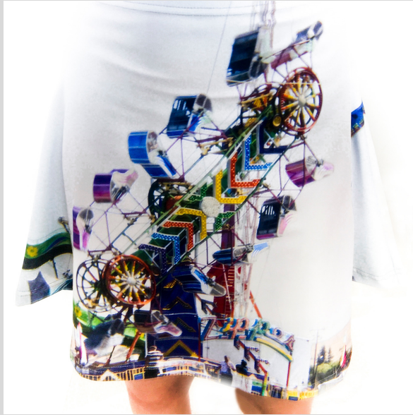
Fun Fair Skirt