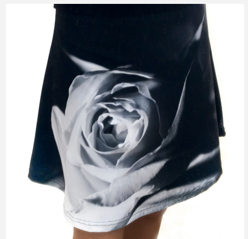
Mystery Rose Skirt