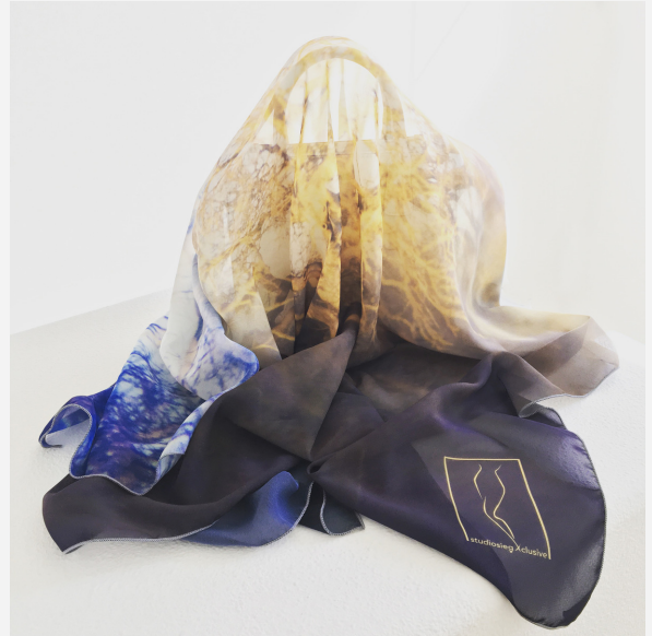
Golden Tree Scarf