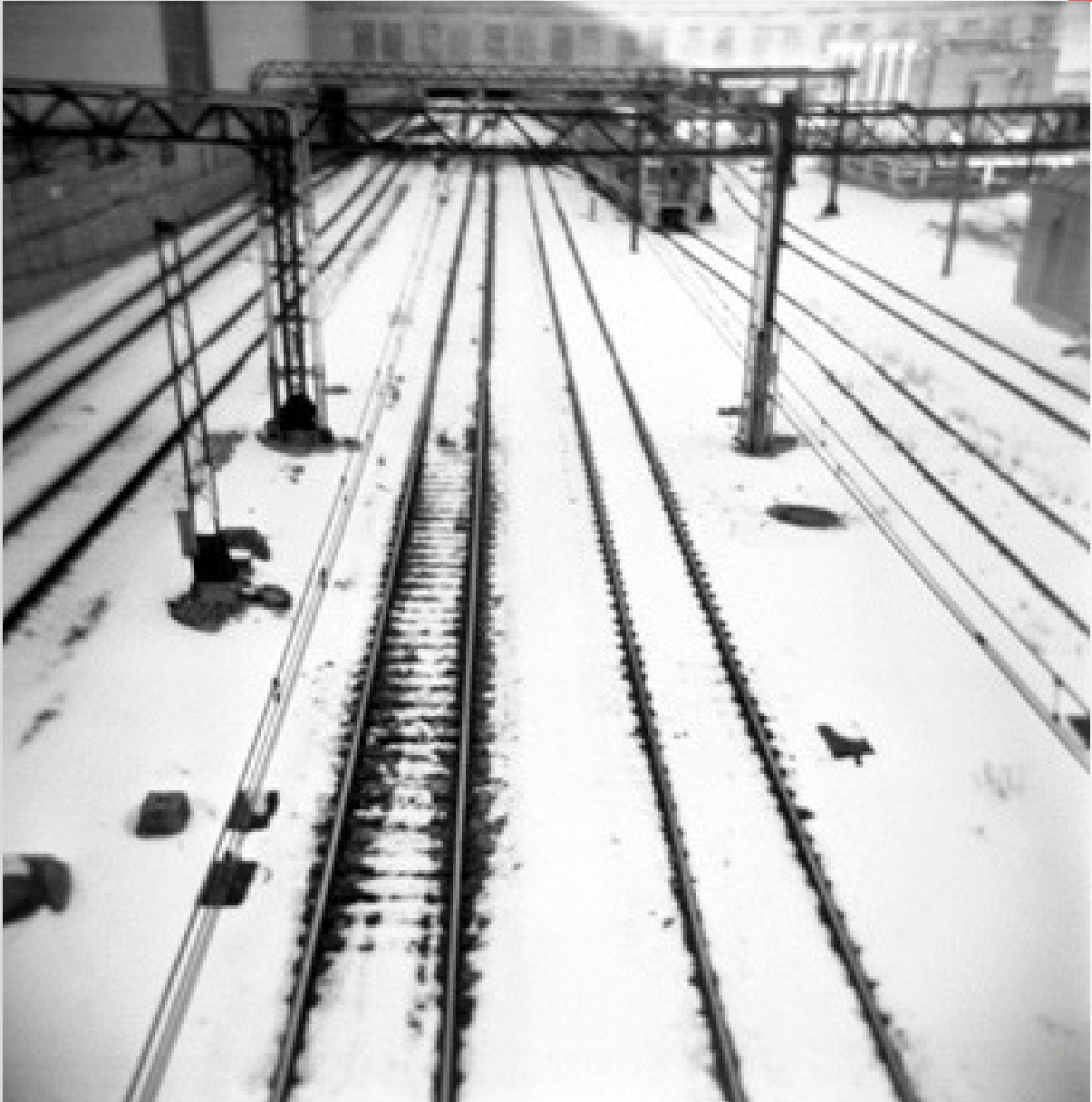
"Railway in the Snow"